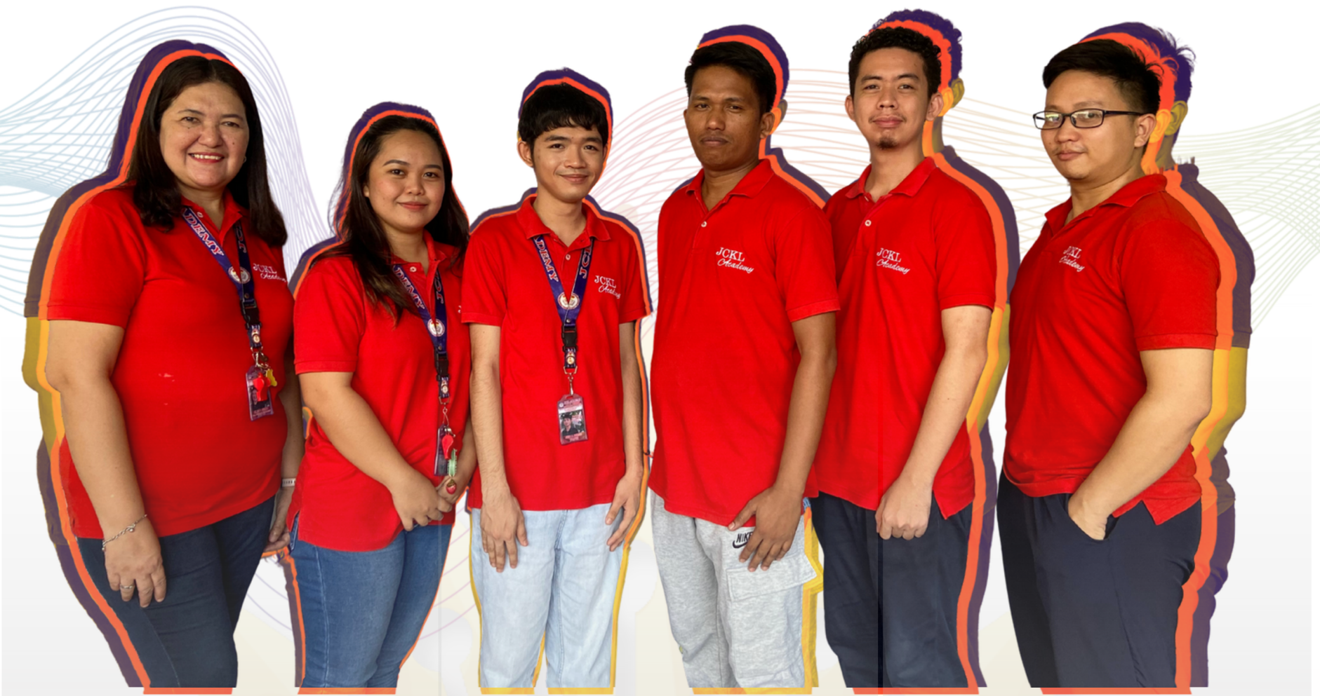
Faculty Association SY 2024 - 2025